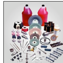
Parts & Supplies