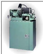
Valve Refacers & Cabinets