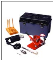
Seat Grinder Sets