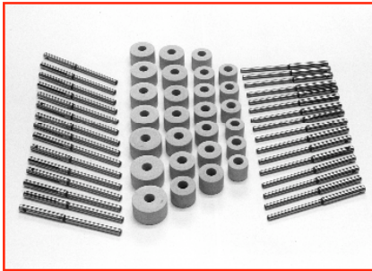
030-0030-00 Master Automotive Set

The Master Automotive Set includes 30 arbors(pilots) and 27 general purpose wheels (stones) with a range of 1-1/4" to 2-1/8" diameter